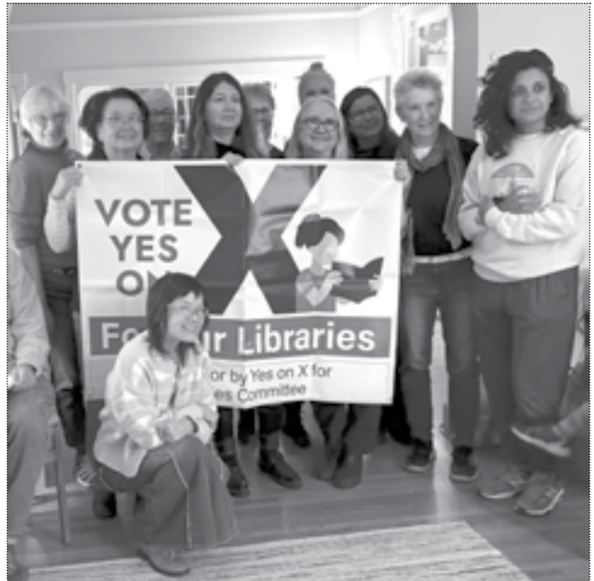
Just some of the devoted volunteers who worked to pass Measure X